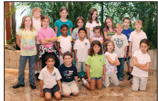
"Kids on the Move"

because God laid the burden on their hearts.