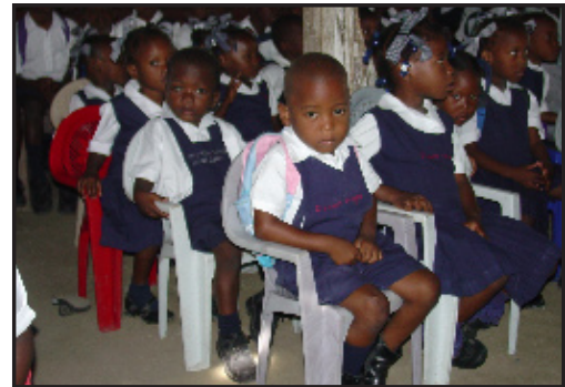
Preschoolers in Haiti